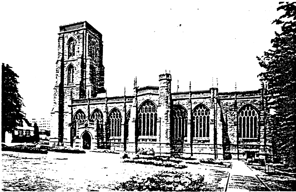
St. John Baptist Church Yeovil, England