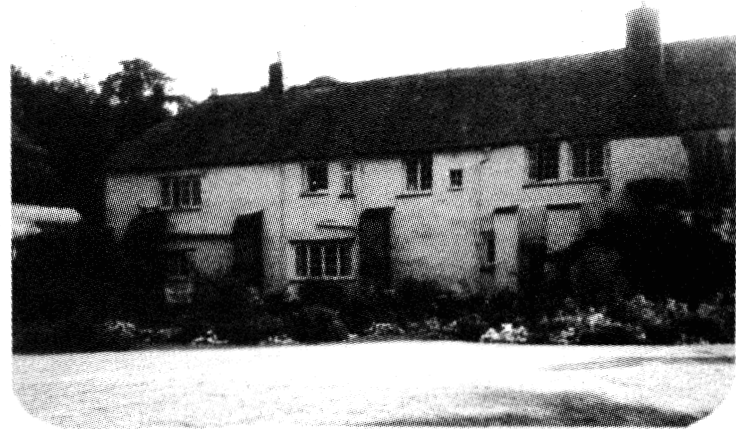
Westcott Barton in Marwood, Barnstable, England