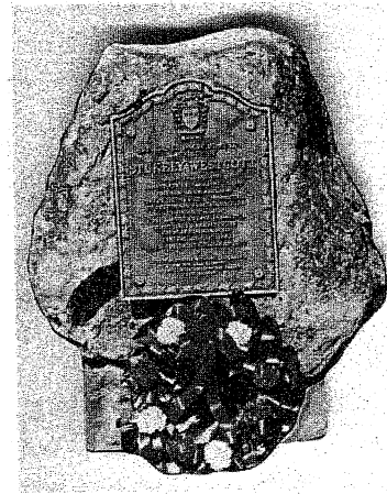
MEMORIAL IN WARWICK, RI