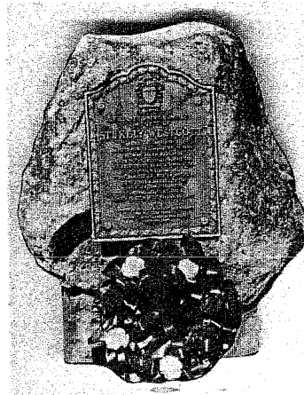
MEMORIAL IN WARWICK, RI