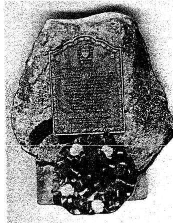
MEMORIAL IN WARWICK, RI