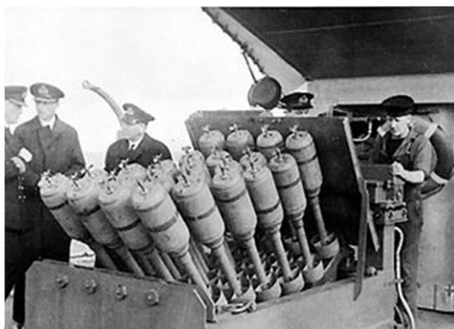
The Hedgehog anti-submarine mortar aboard HMS Westcott