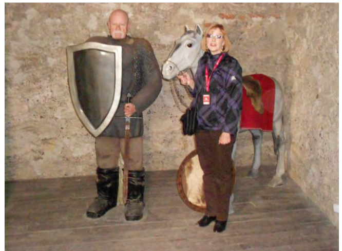
Your editor ready to do battle