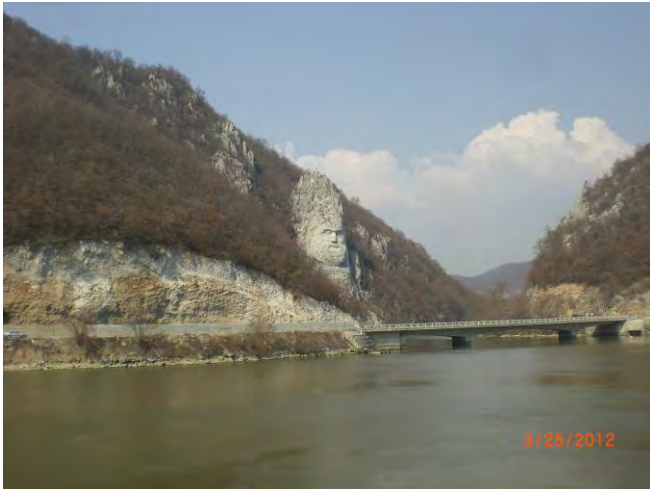
Cruising the Danube – Notice Man on the Mountain