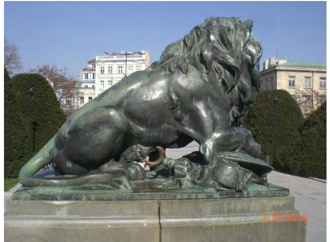
Breaking the Ottoman Rule – Notice the Islamic Crescent in the trash heap.