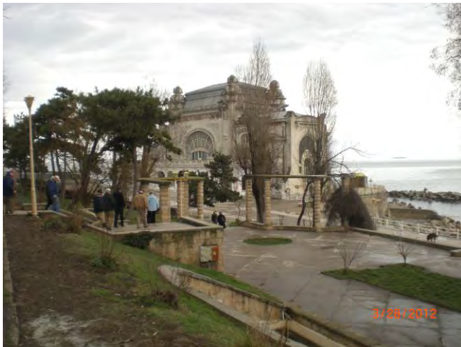
Casino in Constanta, Romania on the Black Sea