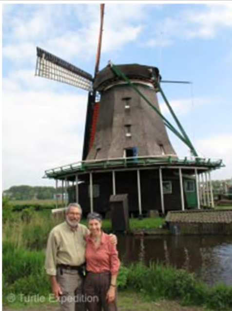
There really are windmills in Holland.