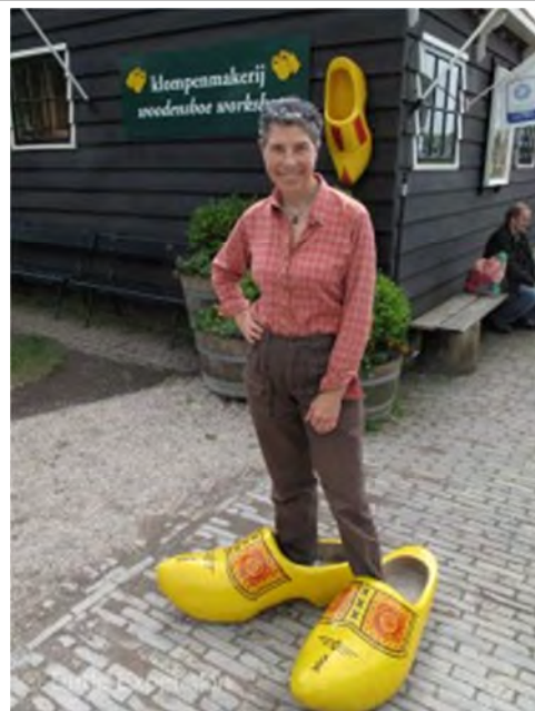
Do you have these in a smaller size?