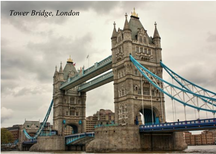
Tower Bridge, London