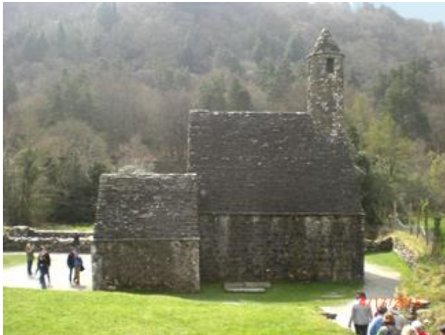
Monastery in Glendalough founded in the 6 th Century by St. Kevin.