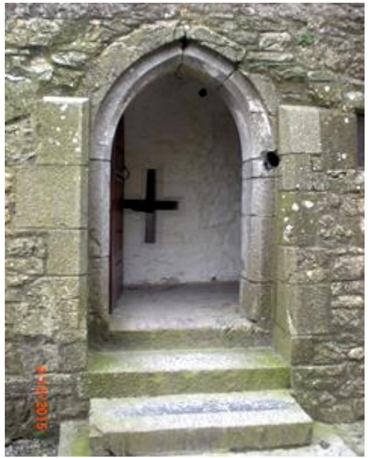
Cahir Castle: Notice the bow slit to accommodate either longbows or crossbows.