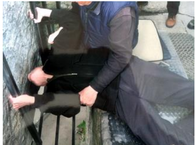
Kissing the Blarney Stone