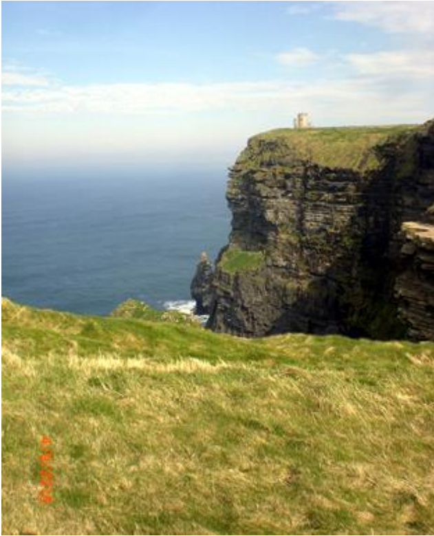
O'Brien's Tower at a distance